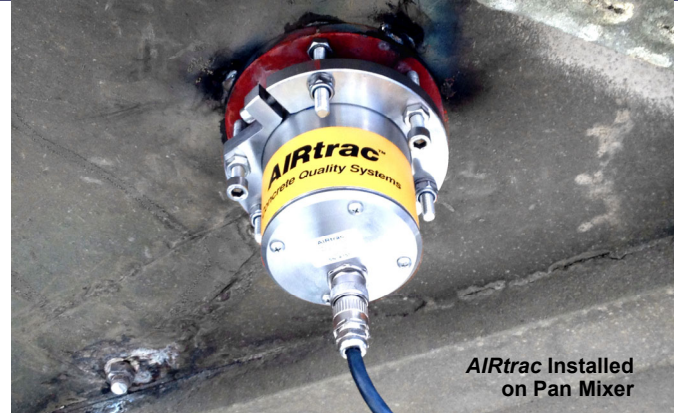
AIRtrac Installed on Pan Mixer